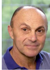
Eugene F. Fama, Ph.D.

K nown as “the father of the efficient markets hypothesis,” Eugene F. Fama is among the most prolific and widely cited economists, scholars, and financial researchers in the world. Over the past 45 years, Dr. Fama’s groundbreaking ideas have reached far beyond academia as his theoretical and empirical studies of asset pricing and portfolio theory have changed the way market participants—both professionals and individual investors—think about and practice finance and investing.